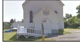
St. Patrick's Church