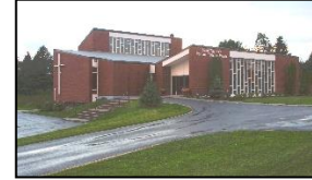
St. Theresa's Church